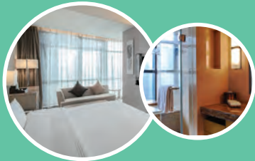
豪华客房 Premier Deluxe Room (51.0m 2 - 59.0m 2 )