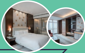
高级套房 Premier Suite (81.0m 2 - 85.0m 2 )