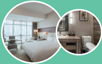
高级客房 Premier Room (37.0m 2 - 43.0m 2 )

关注酒店微信公众号， 探索诸多美食福利和客房优惠！ Follow up our hotel official WeChat account, explore the abundant delicacies and benefits!